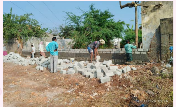
Reconstruction of the Bethel Orphanage wall commenced swiftly with funds donated by Committee donors and shop profits.