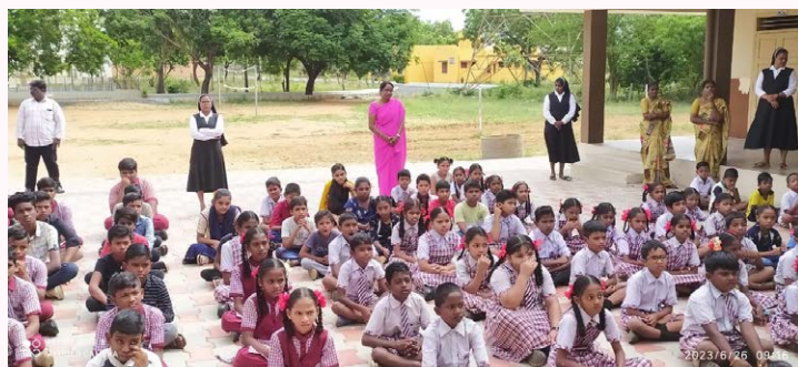
Some of the students at Bethel Orphanage where the Committee sponsors 32 children