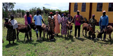
Funds from St Veronica's provided for the distribution of donkeys for transport of food, water, agricultural and educational supplies in remote areas of Ethiopia