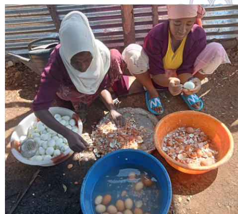
Egg preparation to provide mandatory meal for Goro students, Ethiopia St Veronica 2023 Christmas Appeal