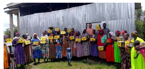
There is no electricity access in Galyarogda and no likelihood of it being installed soon. The St Veronica Christmas appeal supported the purchase of solar lamps for students and families – the lamps enabled students to study at night and for monitoring livestock and agricultural projects after dark

In September, the Committee was pleased to receive a visit from Sister Placida, from Siri Nidhan, Sri Lanka. In addition to resettling slum dwellers, establishing income-earning projects, coordinating students' educational sponsorships, Sister provides counselling, vocational training, and equipment to assist those moving from the slums. Currently there are 36 student sponsorships at Siri Nidhan.