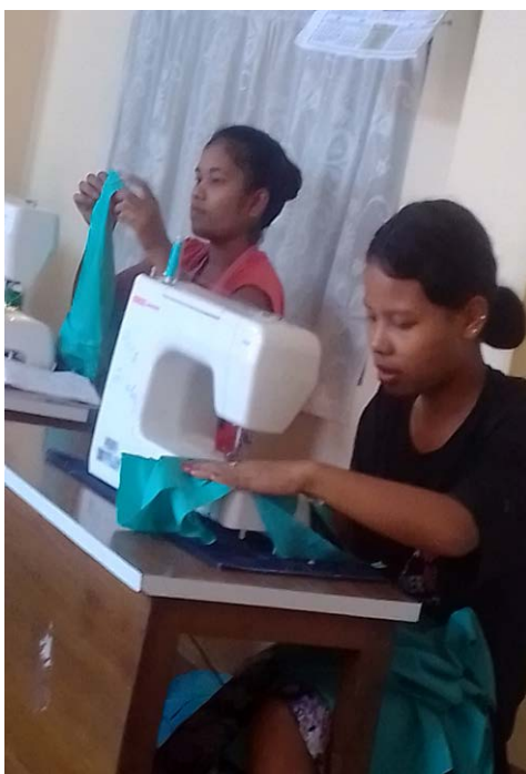
Vocational Training continues at Troncatti Home (2022 Appeal)