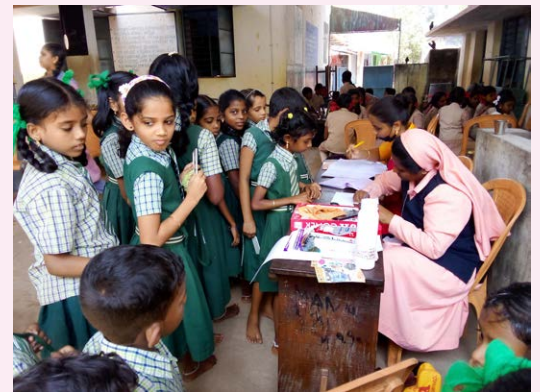
Children attending a medical and dental camp run by the Sisters of St Ann, Nava Jeevan Illam, India. (Camp financed by St Veronica supporters)

Towards the end of 2023, the Sisters of St Ann at Nava Jeevan Illam in India conducted a medical - dental camp for children experiencing poor health post Covid. At the time of compiling this report, 183 school children have received medical and dental check-ups. The Sisters plan to continue the program in 2024 ensuring as many children as possible have the opportunity to attend.