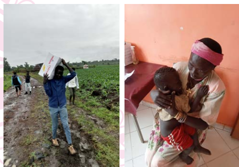
Left: Despite the lack of vehicular access, much needed food arrives in Galyarogda Right: Malnourished infants receive food plus Medical care Ethiopia, 2023