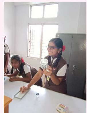
Students from St Joseph's Bethany Navajeevan Vidyalayal enjoy their studies