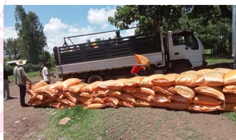
Fertilizer distribution, Galyarogda, Ethiopia