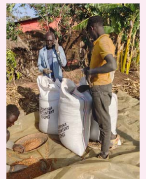
Right: Financially disadvantaged and under-privileged Gumuz people at Galiyarogda, Ethiopia, celebrate a good harvest of maize and chickpeas (seeds and fertilizer financed by St Veronica supporters)