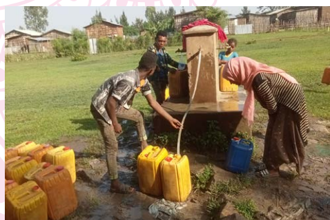
Each day 100 families benefit from potable water from the bore well constructed at Goro, Ethiopia. Funds from St Veronica's supported this program