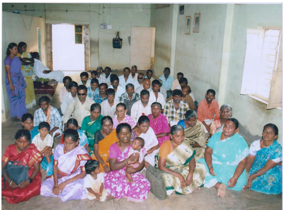
Adults attending the Blind Centre where they learn income-earning skills which 'kindles a ray of home in the lives of the blind'