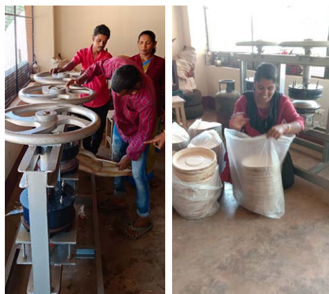
Left: Students attending Jeevan Jyothy Special School, India, continue to produce, package and sell environmentally friendly plates (plate-making machine funded by the Committee) Right: 'LET OUR LIGHT SHINE'