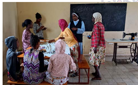
Sacred Heart Sisters in Ethiopia empower disadvantaged local women