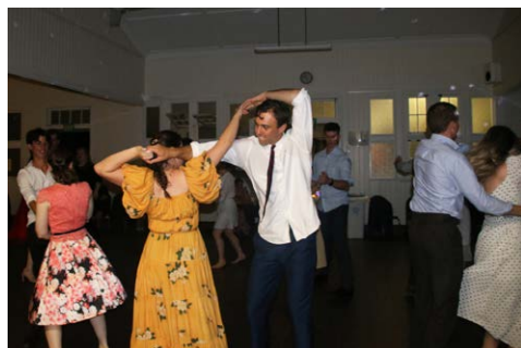
Some of the young people enjoying the Social Dance at St Francis, West End. The event raised funds to support malnourished children in Ethiopia.