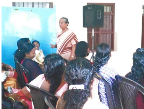
Awareness seminar for children and parents, Charummood.