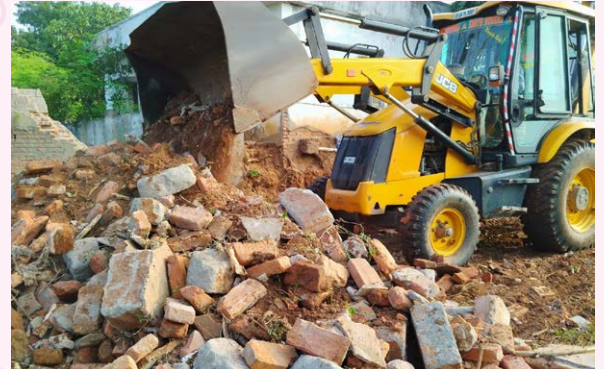
Bethel Orphanage wall destroyed during catastrophic Cyclone Michaung (above)

The catastrophic damage to the orphanage grounds caused by Cyclone Michaung required urgent reconstruction. In the past government officials have insisted on prioritising the children's security and St Veronica's has helped provide funds for closed circuit cameras, fire extinguishers and iron mesh doors to comply with government requests.